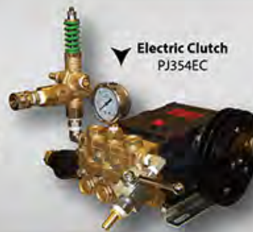
Electric Clutch PJ354EC