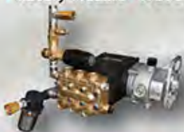
◀ Gearbox Pump