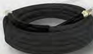
High Pressure Hose

4000 to 10,000 PSI 3/8" & 1/2" 30'/50'/100'/150'/200'