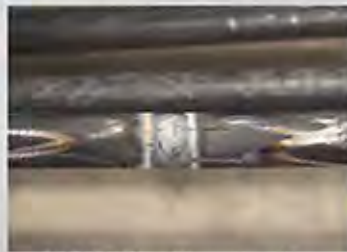
100% Pipe Penetration