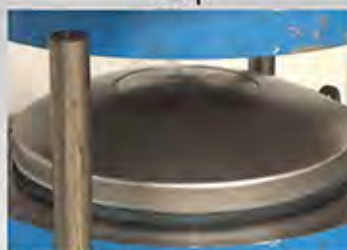
Coil Head Stamping