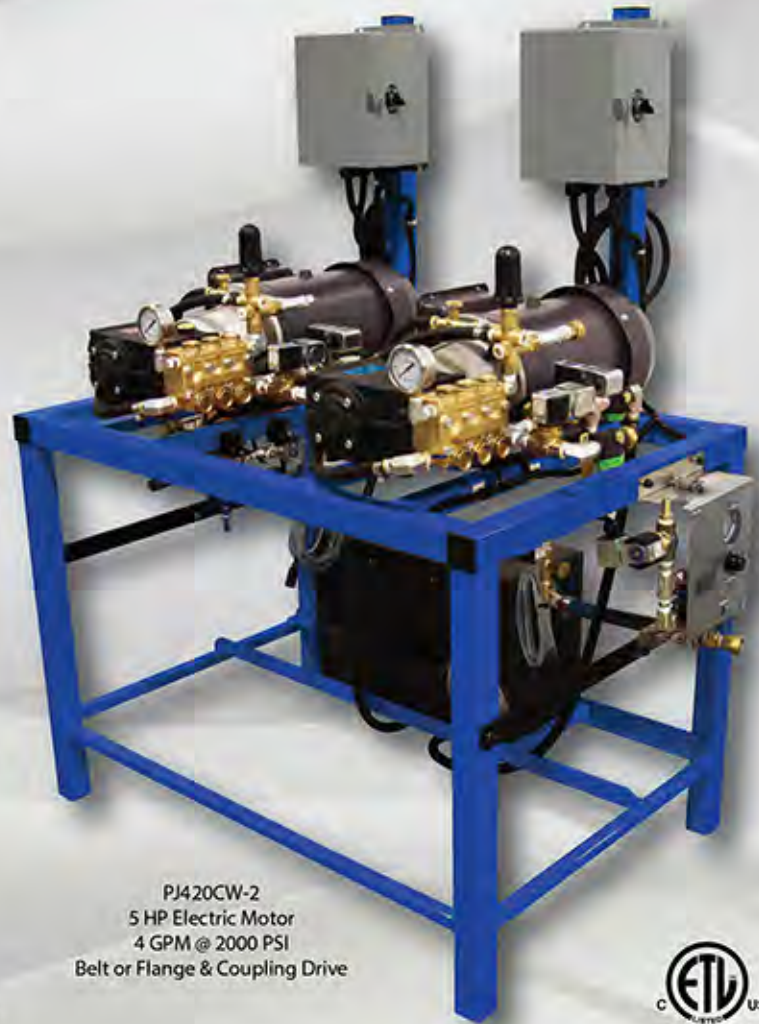
PJ420CW-2 5 HP Electric Motor 4 GPM @ 2000 PSI Belt or Flange & Coupling Drive

Power Jet has taken pride in designing and manufacturing fool proof, easy to install and maintain self serve car wash systems that will provide savings from installation to maintenance for years to come.