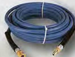
Non-Marking High Pressure Hose

4000 to 10,000 PSI 3/8" & 1/2" 30'/50'/100'/150'/200'