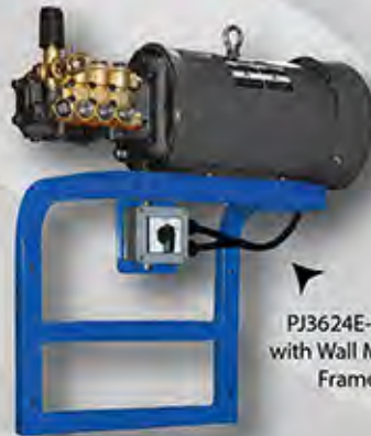
PJ3624E-WM with Wall Mount Frame

Our electric driven cold water units are used for multiple applications for farm, car and truck washing, meat shops and every day uses.