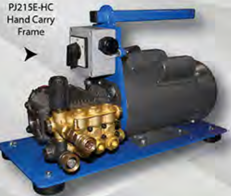
PJ215E-HC Hand Carry Frame