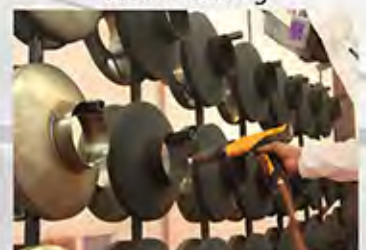
Powder Coating Coil Heads & Frames