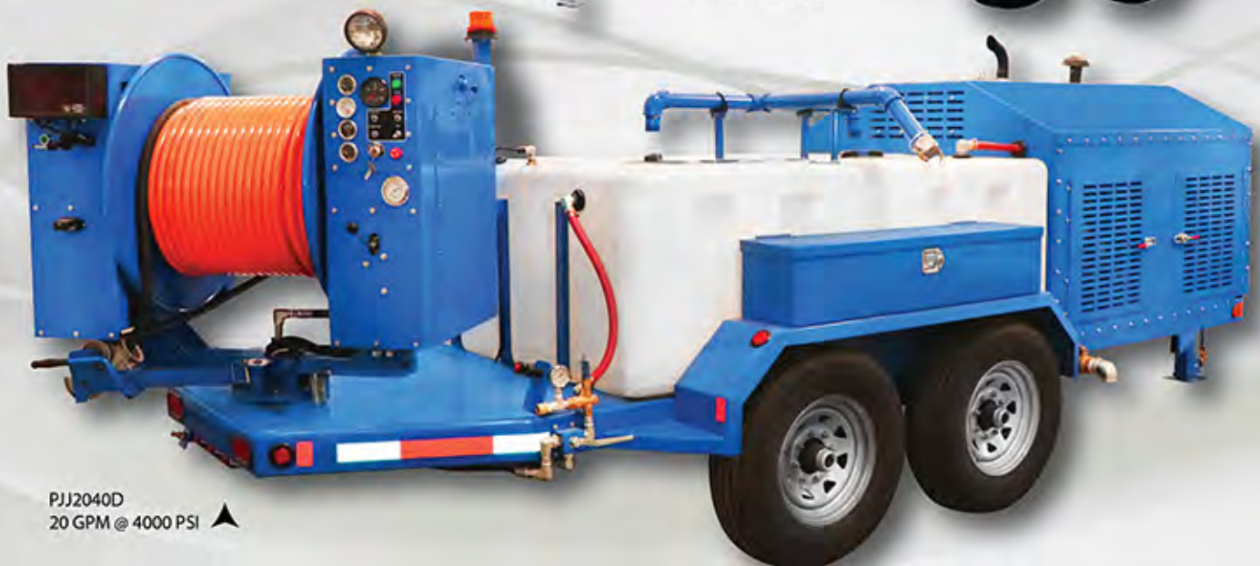
PJJ2040D 20 GPM @ 4000 PSI ▲