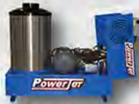
Unit Shown with Shroud Tipped Ahead

In Iowa this 5 GPM @ 3000 PSI machine will be washing farm equipment and semi trucks.