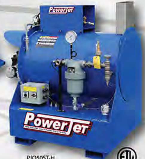
PJO50ST-H 50 BPH Horizontal Option Add (-H)