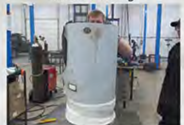
Installing Stainless Steel Housing