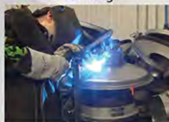
Welding the Coil Head Stack