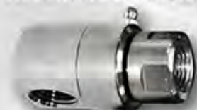
Greasable Super Swivel