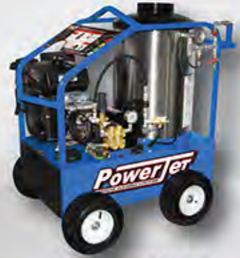
PJO3015G-K-GP-STM 1.5 GPM @ 300 PSI

14 HP Kohler Gas Engine, 300° F Output Temp. Ideal for users with specific applications such as: Thawing ice, fire hydrants, decal removal, truck scales, and restaurant vent cleaning. Less versatile than a combo unit but if all you require is wet steam, this compact package is ideal!