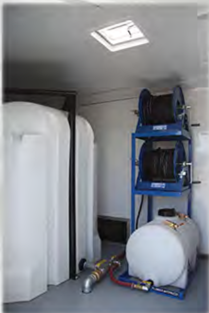
Hose Reel Rack