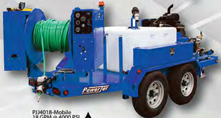
PJJ4018-Mobile 18 GPM @ 4000 PSI ▲