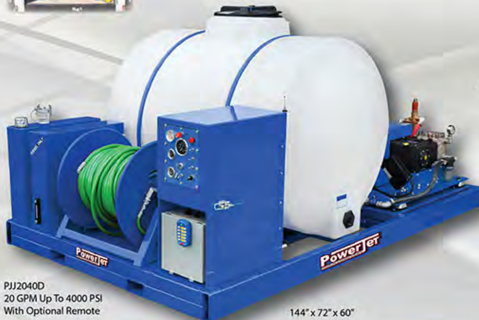
PJJ2040D 20 GPM Up To 4000 PSI With Optional Remote