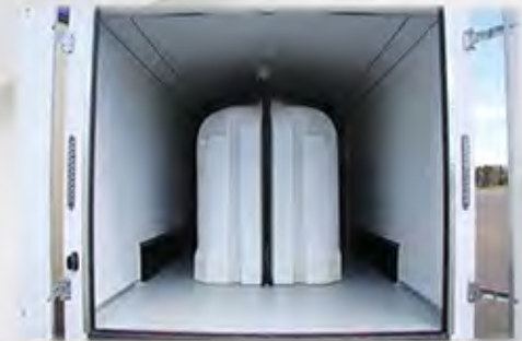
740 Gallon Water Tank (Back)