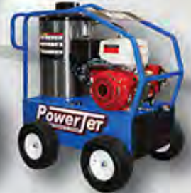
PJO4004-12-H-GP ETL Intertek USA SA