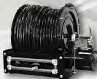
Hose Guides For 12 & 120 Volt Reels