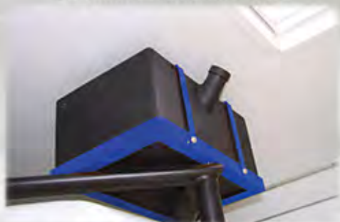
10 Gallon Chemical Tank