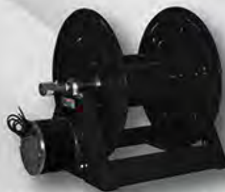
12 Volt Automatic Rewind