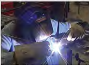
Pipe Fusing Process