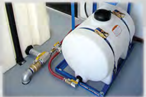
35 Gallon Antifreeze Tank