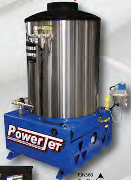
PJN560 Gas Fired

Stand alone heaters designed for heating high pressure water efficiently.