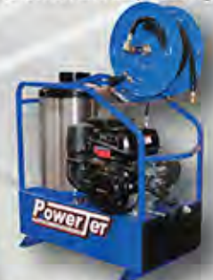
PJO4004-12-K-GP-ST Shown with Optional Hose Reel