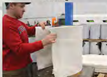
Ceramic Insulation Wrap