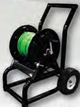
Hose Reel Carts For Manual A-Frame Reels