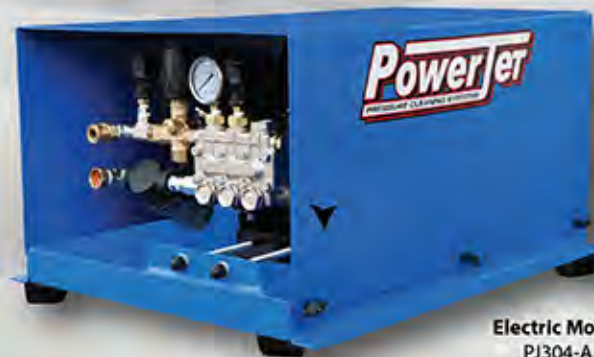
Electric Motor PJ304-A