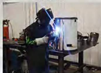
Welding Stainless Steel Housing