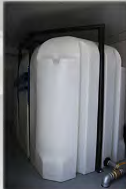
740 Gallon Water Tank (Front)