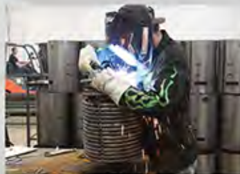
Welding Additional Bracing