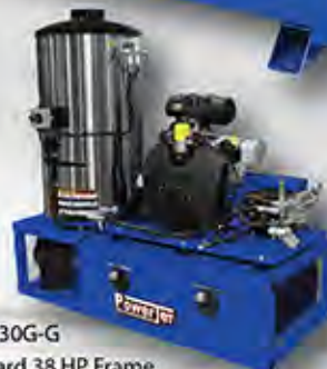
PJO1030G-G Standard 38 HP Frame

PowerJet Pressure Industrial Hot Water Gas