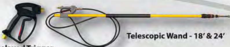
Relaxed Trigger Gun (Vega)

12'/ 18'/ 24'/ 36" (Standard)/ 48'/ 59'/ 72"