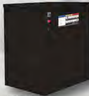
PJE48 Electrically Heated