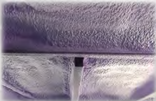
Spray Foamed Floors

Fully Customizable to Meet Your Specification and Application