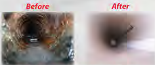
Used for Installing Municipal Liners