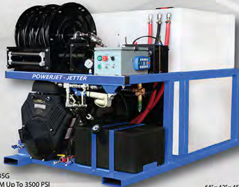
PJJ1235G 12 GPM Up To 3500 PSI With Optional Remote