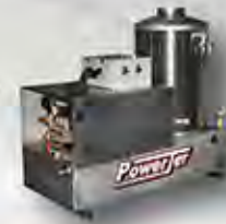
Stainless Steel Frame