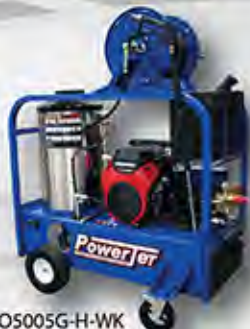
PJO5005G-H-WK Wheel Kit & Hose Reel Option