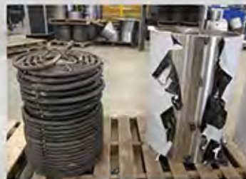
Completed Pipe Interior