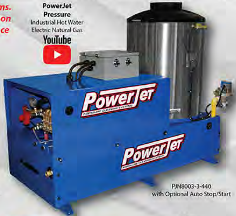
PJN8003-3-440 with Optional Auto Stop/Start