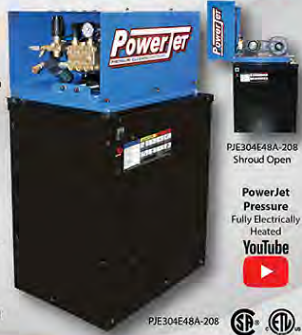
PJE304E48A-208 Shroud Open

* Units with Double Coils (Large Heating Capacity)