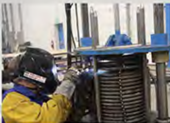
Compressing & Welding Pancake Bracing