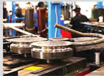
11 Axis Pipe Maneuvering