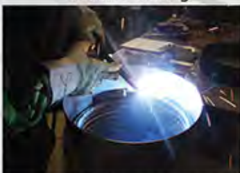
Welding Interior Pipe to Housing