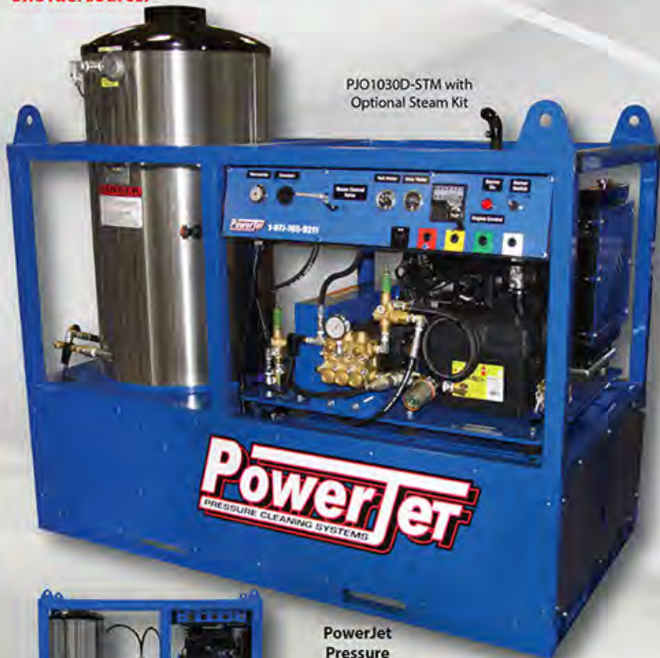
PJO1030D-STM with Optional Steam Kit

This series of hot water pressure washers are designed to be truck or trailer mounted for mobile washing purposes. These units are ideal for use within municipal, mining, oil field, forestry and industrial cleaning operations. These units can also be mounted on a skid frame in combination with 225, 525 or 740 gallon water tanks and a variety of hose reel and accessory options to create a totally customizable self contained system. Diesel engines are optimal for long hours of efficiency using only one fuel source.