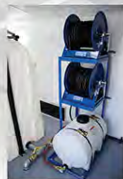
Stationary Hose Reel Stands