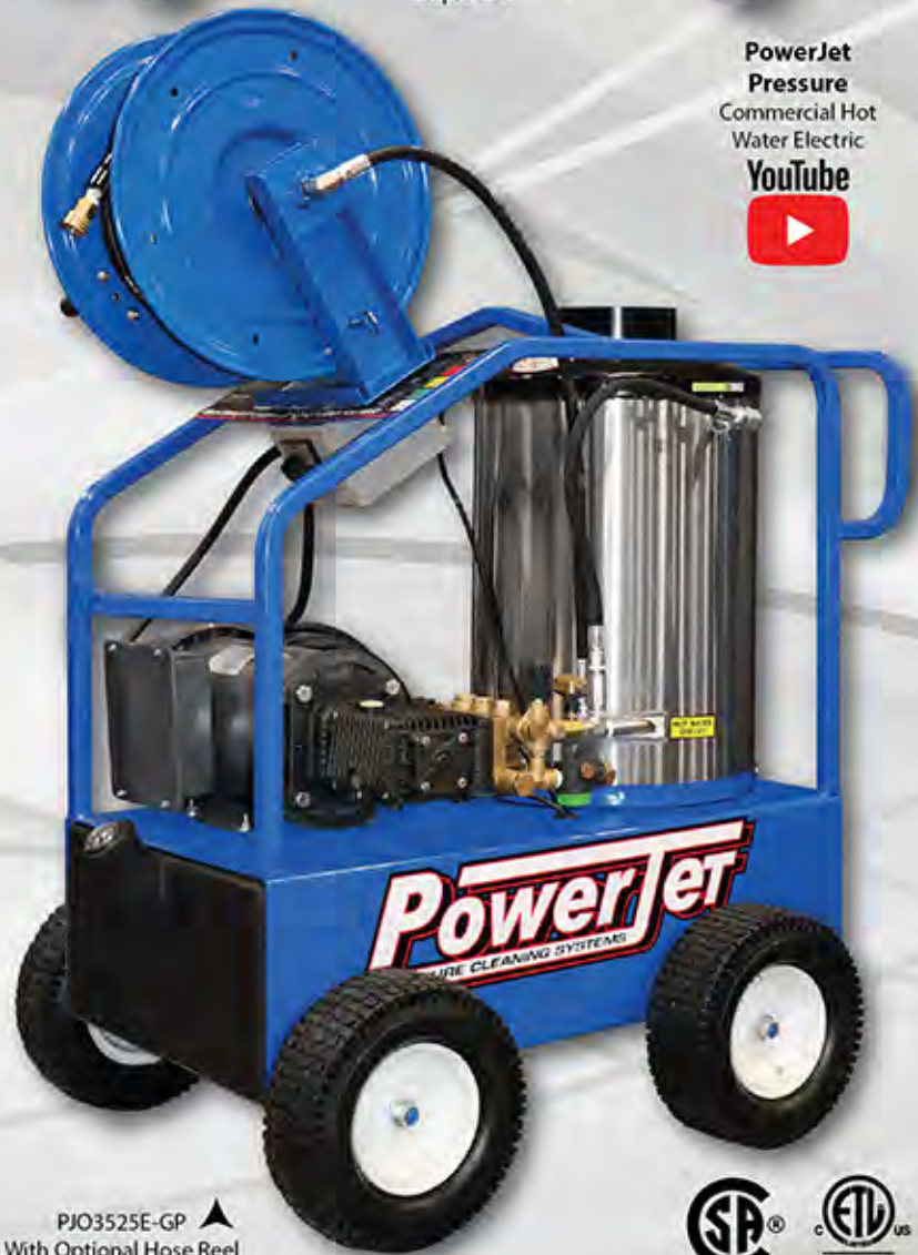
PJO3525E-GP With Optional Hose Reel