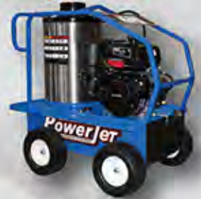
PJO4004-12-K-GP Rental Frame - For Total Protection and Easy Loading