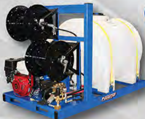
▲ PJ354GHGPBD Optional Tank Skid Available

The commercial cold water gasoline driven series are designed for everyday commercial cleaning jobs.