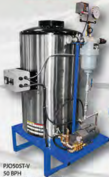
PJO50ST-V 50 BPH Vertical Option Add (-V)

The rugged frame is designed to protect all components and ensure these units are easy to maintain and service.