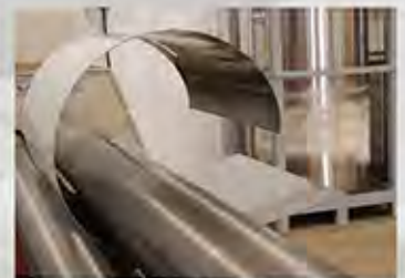
Rolling Stainless Steel Housing