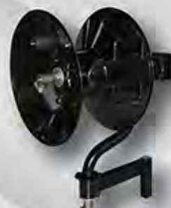
360 Pivot Reel