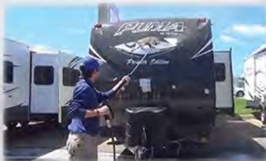
72" Wand In Use

Ideal for RV dealerships, car lots, equipment rental shops and RV parks. Designed to be pulled behind ATVs or small tractors allowing you to bring your pressure washer to your lot inventory instead of hauling it to the pressure washer saving both time and resources.